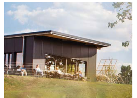
A crowd favorite: the once temporary cultural center Hafen 2 has long become an institution