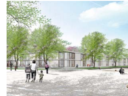
Daycare center and elementary school with sports hall