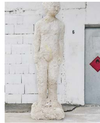
University of Art and Design (HfG)

Cultural and leisure institutions significantly contribute to the creative flair of the district. An urban micro cosmos has already formed, which makes Offenbach Harbor a valued meeting place, even beyond the city borders. The University of Art and Design (HfG) prominently anchors the education issue at the harbor. The harbors own all day school with its daycare center contributes to the family and employee friendliness of Offenbach Harbor.