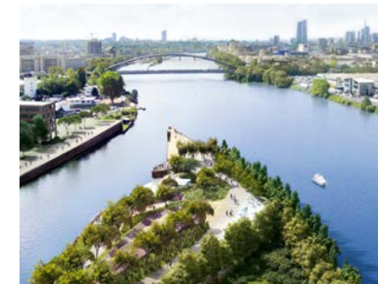
Barefoot in the sand, thoughts are free: a short vacation in the island park at the dunes