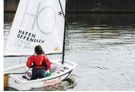
Watersports along with the harbors' own marina form part of it