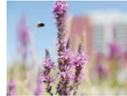
50% open space – a lot of room for relaxation, leisure and sports