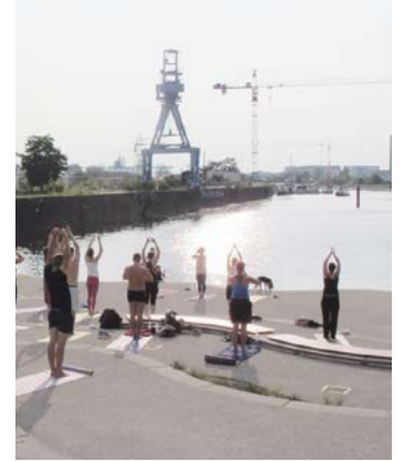
A gym is good, the harbor steps are better: sport and wellness in the fresh air