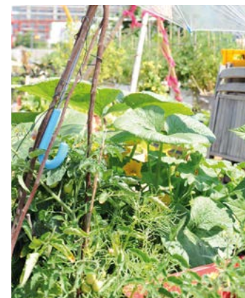
Home grown fruit, vegetables and flowers: the urban gardening project is bringing people together